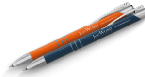
Pen / Pencil